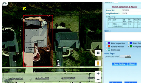
Harris Govern Sketch Validation

Minimal Tech Investment: Access via web browsers without costly hardware upgrades, supporting open platforms like Windows, Linux, and Unix.